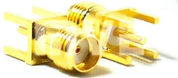
Recommended Mounting Hole